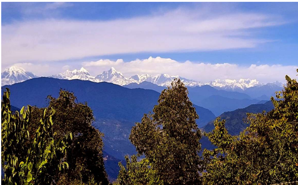
KRADADI SNOW RANGE OF THE HIMALAYAS, VISIBLE FROM RK MISSION CAMPUS