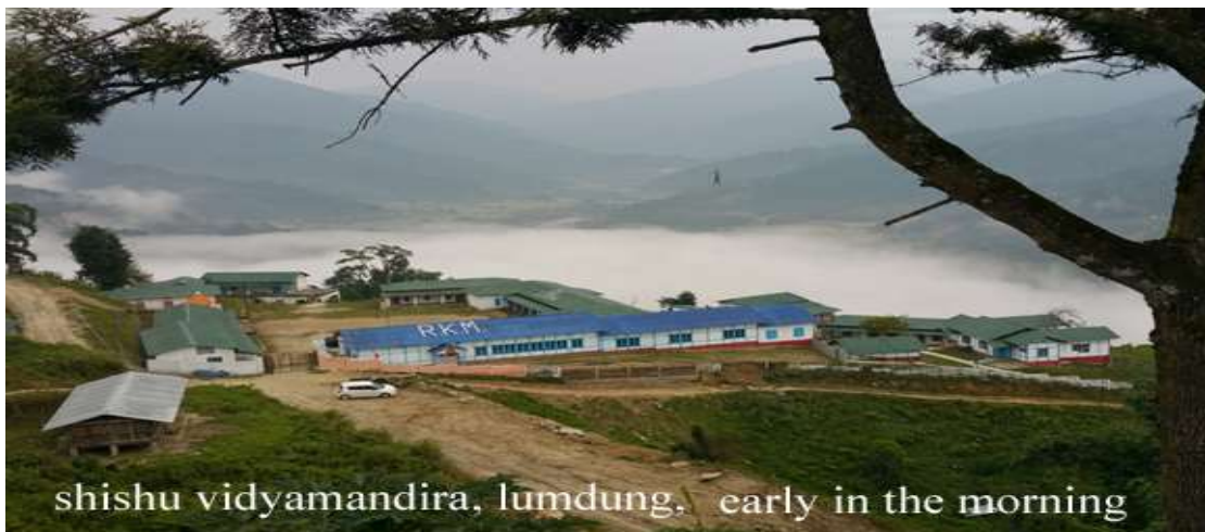
shishu vidyamandira, lumdung, early in the morning