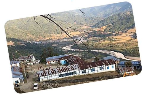
PAPPU VALLEY IN BIRD'S EYE VIEW

The extra ordinary natural beauty of the Pappu Valley and long behind towards Chayang Tajo the view of the snow peaks are of special attraction from the new plot of RKM Lumdung. The people of East Kameng now believe that in near future Lumdung will become a place of tourist attraction as well.